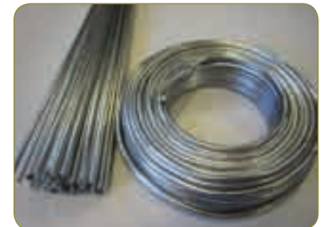
Aluminium Wire incredible prices useful straight lengths at 25p/metre!

".. Thank you so much for the astonishing speed at which you have been able to supply our order... it is here; disaster is averted!"