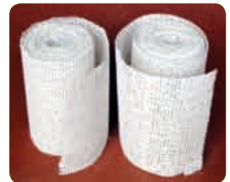
Modroc unbeatable prices compare and buy!