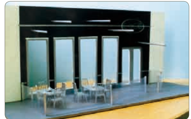
Shop front project - Thomas Alleyes School, Uttoxeter