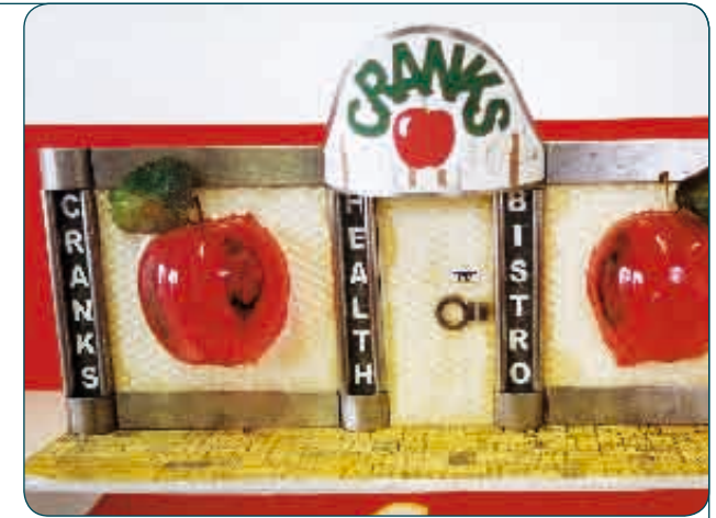
Foamboard shop-front project using clear vacuum forming PVC