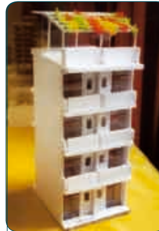
DeMontfort University Leicester Department of Architecture