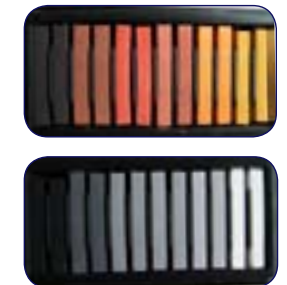
Sanguine to Sepia Black to White

Seawhite Sketching Media caters for all your requirements at highly competitive prices