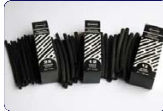
English Willow Charcoal