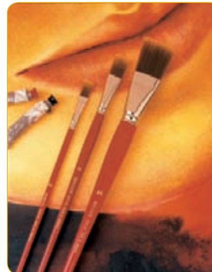
Acrylic Brushes slightly coarser fibres especially suited to acrylic paints